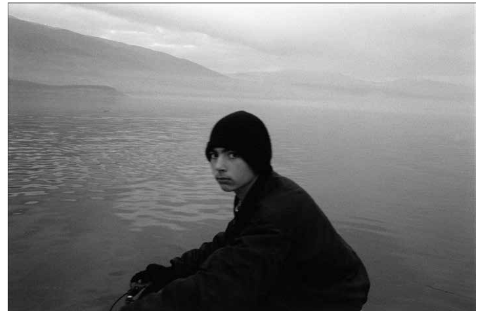
North Greece