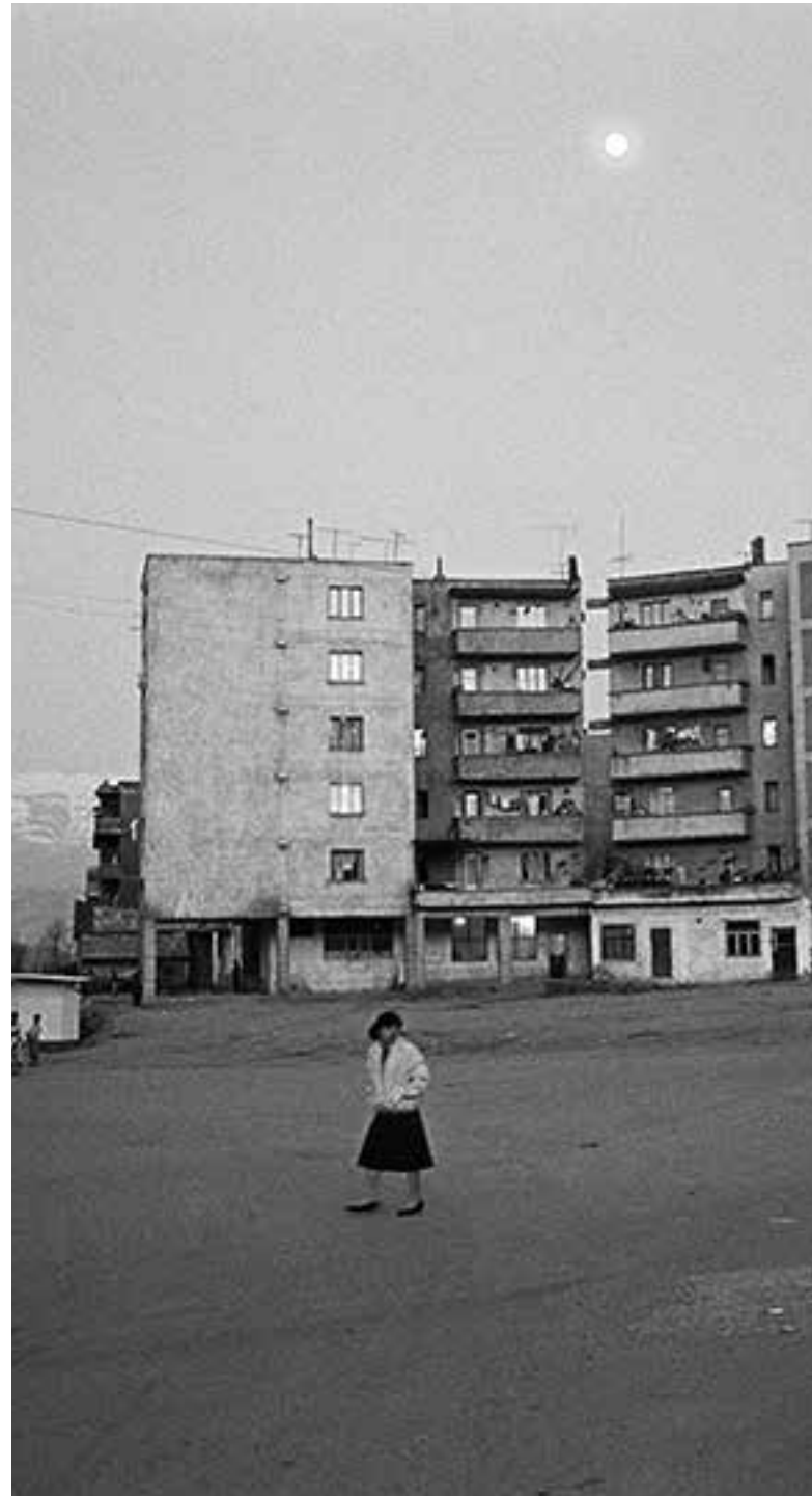
Albania