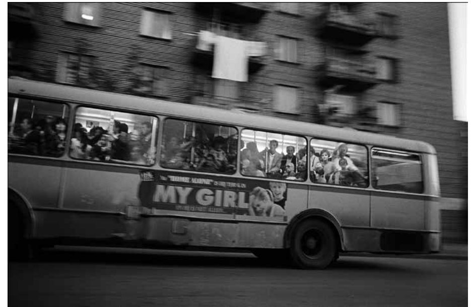
Albania, © Klavdij Sluban

This programme has been elaborated considering all the aspects that will make this workshop as pleasant as can be (atmosphere, logistics, technical aspects, material aspects,...). Yet, some changes can occur due to unexpected circumstances. Participants will be informed immediately. Which means highly recommended to buy refundable transport reservations.