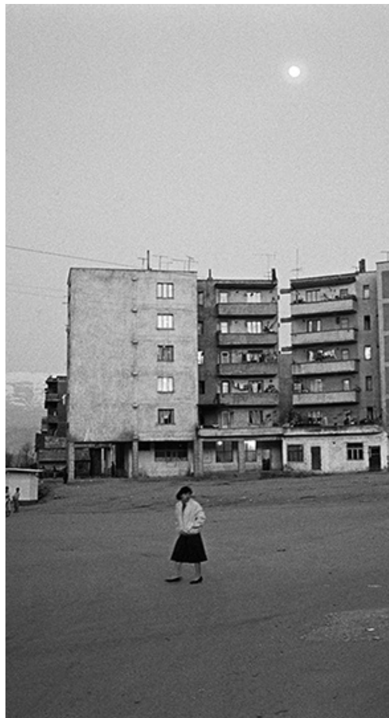
Albania

Klavdij Sluban has published “Balkans-Transit” with the writer François Maspéro in 1997. Translated in several languages, the book helps to understand this region as fascinating as complex.