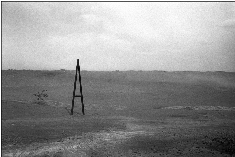
Kosovo, © Klavdij Sluban

Tereza is coordinator of East To East Photography. If you wish further information, you can call or email: