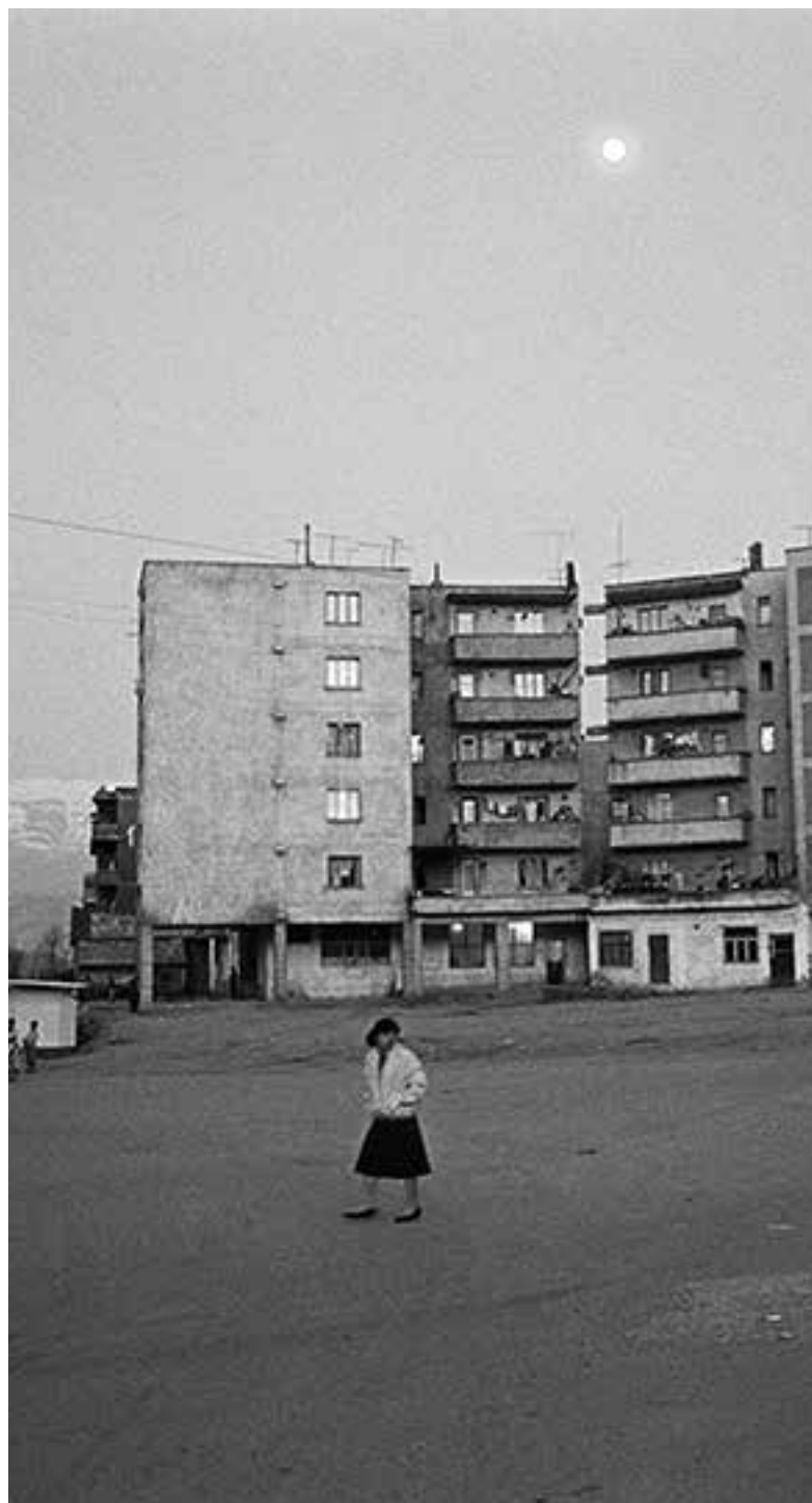
Albania