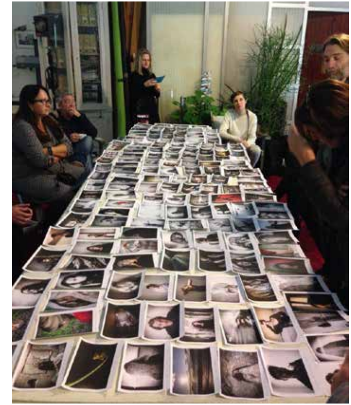
Le Masterklass, Paris, 2015