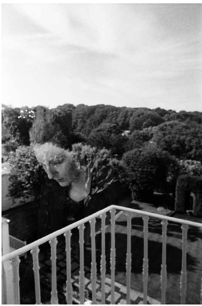
Hauteville house, Maison Victor Hugo, Guernsey, 2013

<u>4pm to 5.30pm :</u> Editing. Participants get contact proofs of photos made the previous day. <u>7.30pm :</u> Group dinner in a restaurant combining traditional dishes with modern cuisine. Different kinds of traditional dishes also available.