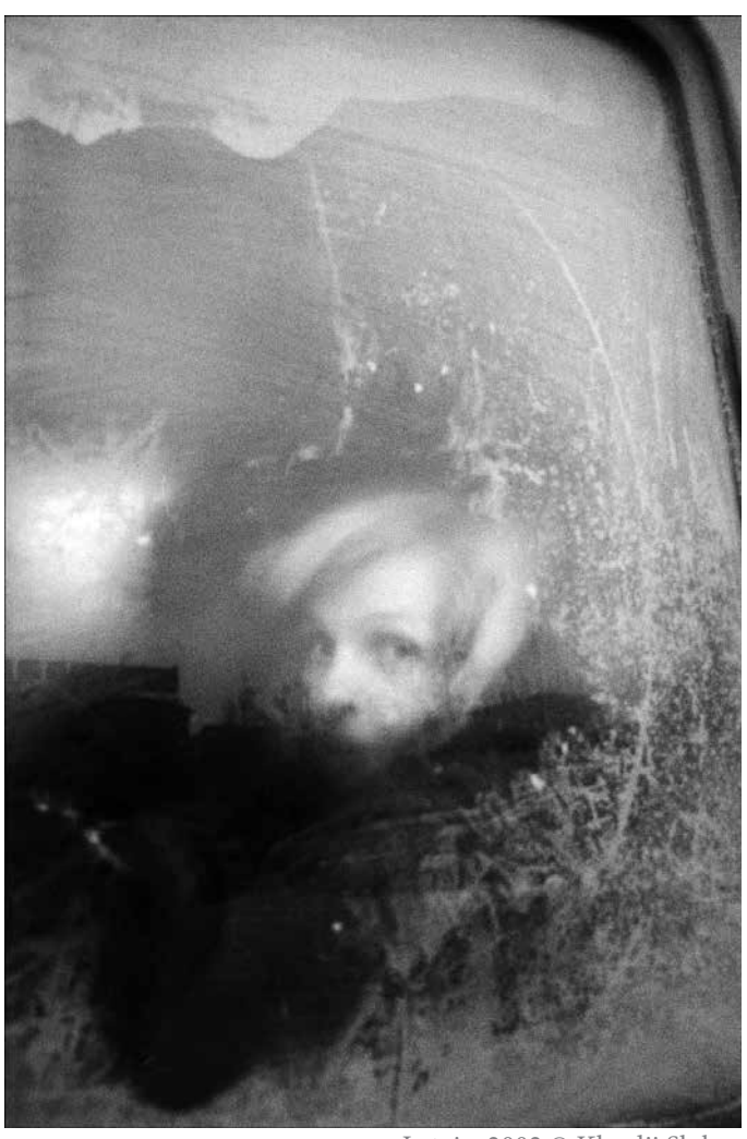
Latvia, 2002

This workshop consists of developing one's personal photographic writing throughout a unique exploration of Slovenia. Klavdij Sluban's capacity of sharing and transmitting photography helps each participant to find their skills as an author. Photographing outdoors will be followed by everyday sessions of editing, main pillar to build a coherent and meaningful series.