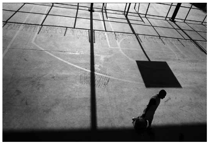
Izalco prison, Salvador, 2008