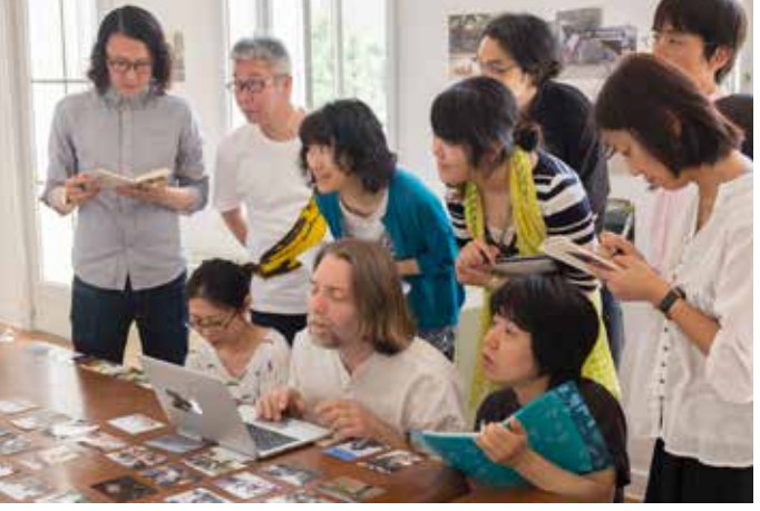
Kyotographie workshop, Kyoto, Japan, 2016

home-made food is served in an authentic family atmosphere. After lunch, visit of the surroudings of the lake. <u>4pm :</u> back to Ljubljana <u>4pm to 6pm :</u> Editing. Participants get contact proofs of photos made the previous day. <u>8pm :</u> Goup dinner in old Ljubljana.