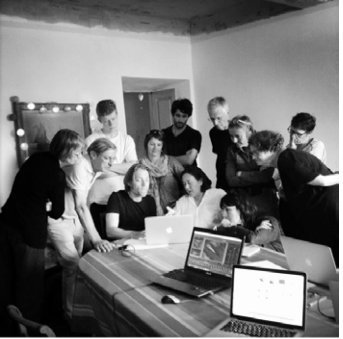
Fotograficasa workshop, Corsica, France, 2014

Slovenia laying in South Central Europe is a mix of traditional culture and modern way of life. At the same time, Nature is a main asset : in 2016, Slovenia was declared the world's first green country by the European Commission « <u>Green Destinations</u> ».