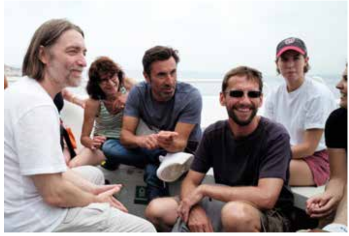
Workshop at Les Rencontres d'Arles, 2017