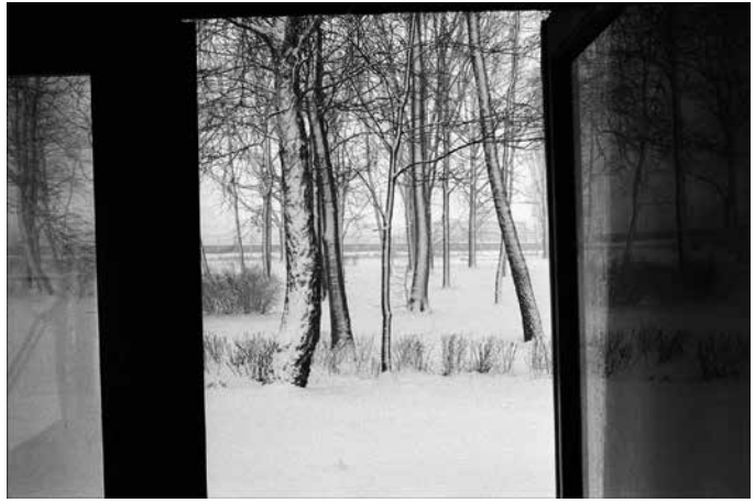
Poland, 2005