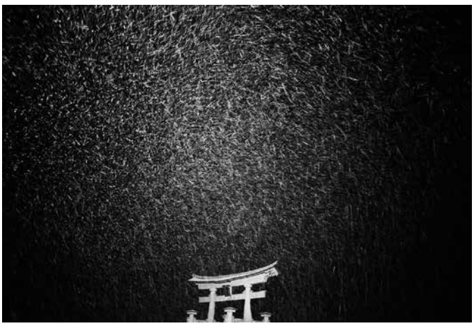
Miyajima, Japon, 2016