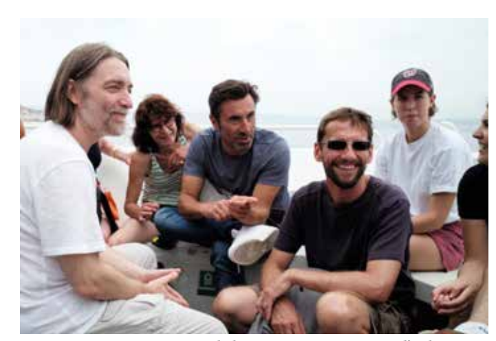
Workshop at Les Rencontres d'Arles, 2017