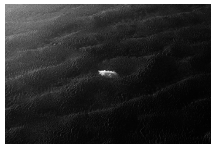
The Living Book, 2015 © Tereza Kozinc