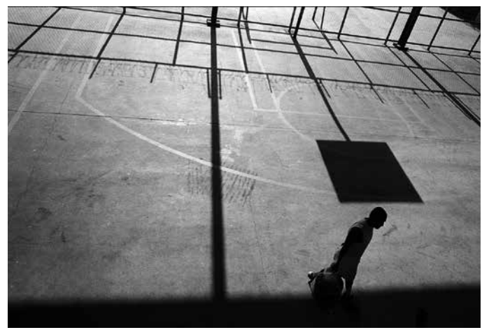
Izalco prison, Salvador, 2008