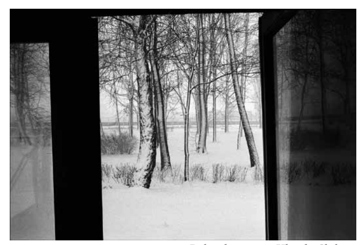
Poland, 2005