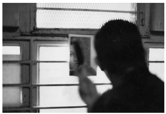
Fleury-Merogis prison, France, 1995