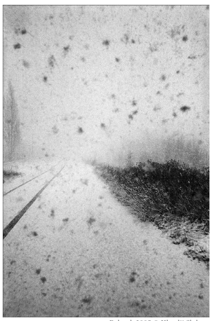
Poland, 2005