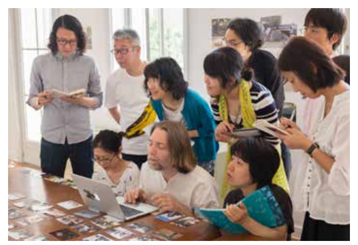
Kyotographie workshop, Kyoto, Japan, 2016

This programme has been elaborated considering all the aspects that will make this workshop as pleasant as can be (athmosphere, logistics, technical aspects, material aspects,...). Yet, some changes can occur due to unexpected circumstances.