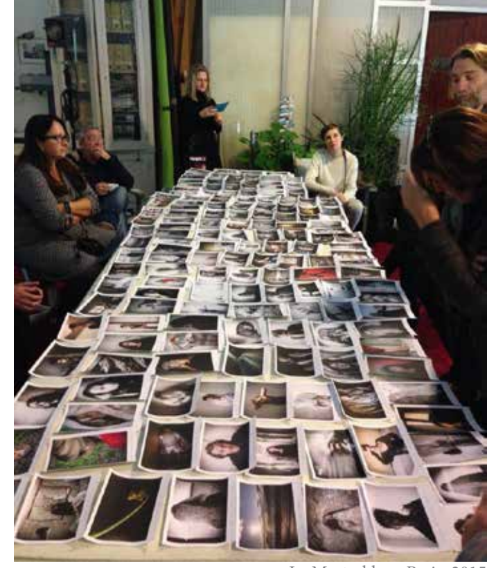
Le Masterklass, Paris, 2015