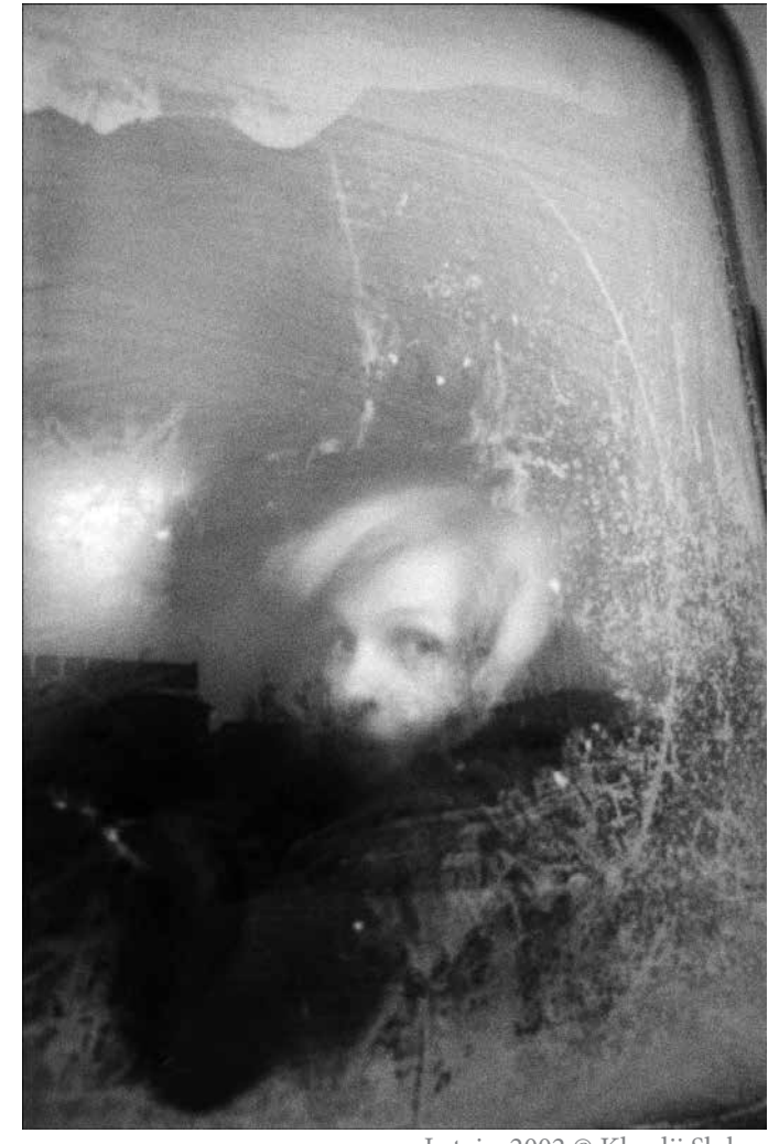
Latvia, 2002

This workshop consists of developing one's personal photographic writing throughout a unique exploration of Slovenia. Klavdij Sluban's capacity of sharing and transmitting photography helps each participant to find their skills as an author. Photographing outdoors will be followed by everyday sessions of editing, main pillar to build a coherent and meaningful series.