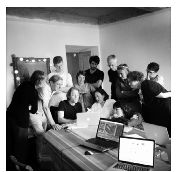
Fotograficasa workshop, Corsica, France, 2014

Slovenia laying in South Central Europe is a mix of traditional culture and modern way of life. At the same time, Nature is a main asset: in 2016, Slovenia was declared the world's first green country by the European Commission « <u>Green Destinations</u> ».