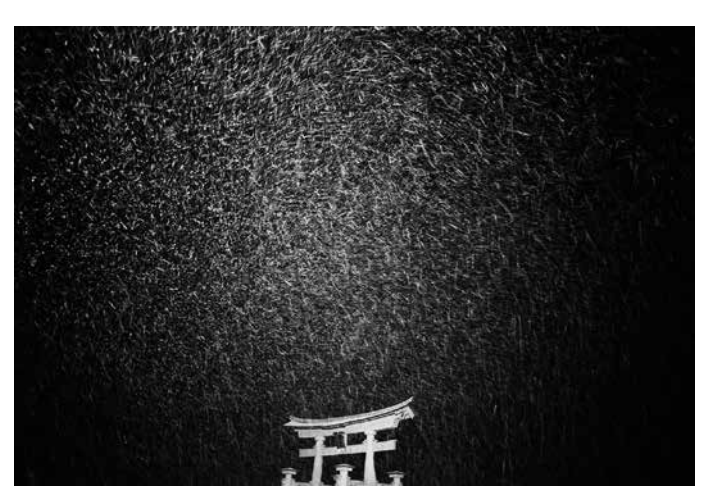
Miyajima, Japon, 2016