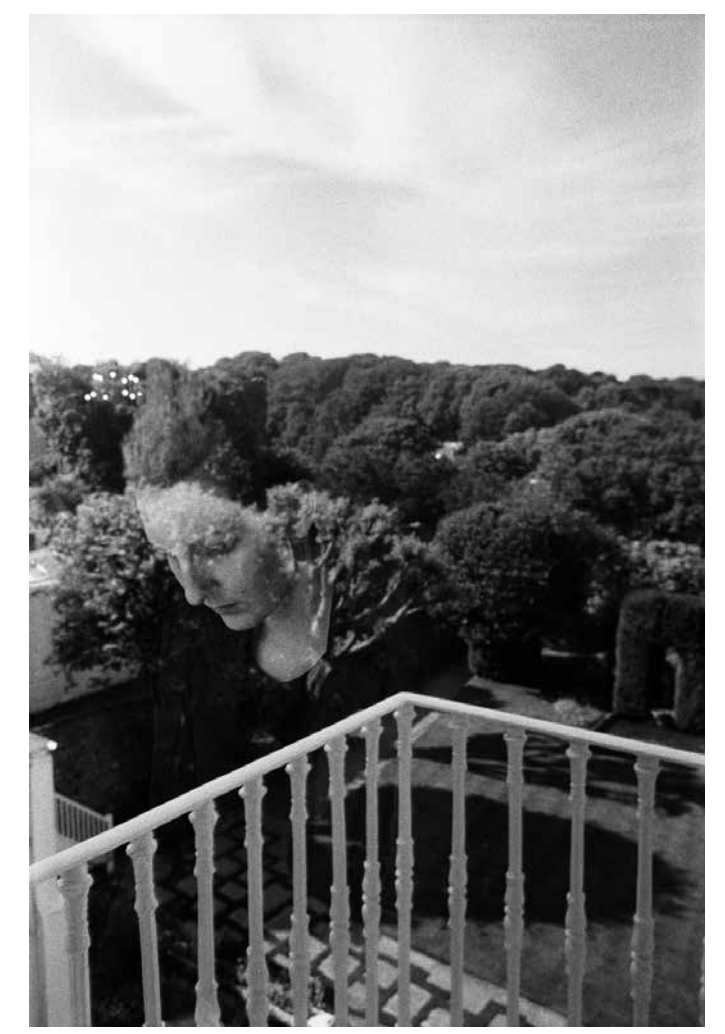
Hauteville house, Maison Victor Hugo, Guernsey, 2013

<u>9am</u>: departure to Lake Bled and Lake Bohinj by minibus (West of Ljubljana). Bled gives a impressive view on the castle overlooking the lake. A stop will be made in Villa Bled to have a cup of tea in president Tito's tearoom, with its original furniture and photos.